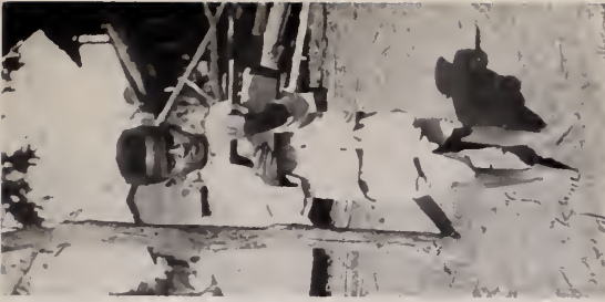
On the way to school